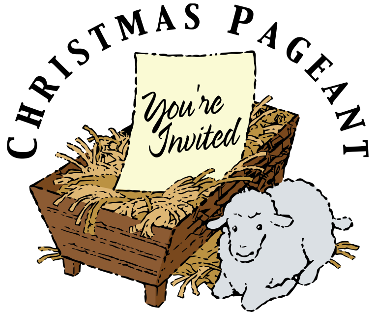
CHRISTMAS POTLUCK AND PAGEANT!!